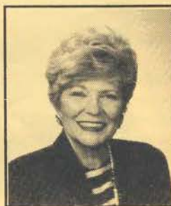
Joy Woods Realtor®

MARCH SPECIAL 20% OFF Bedspreads & Comforters